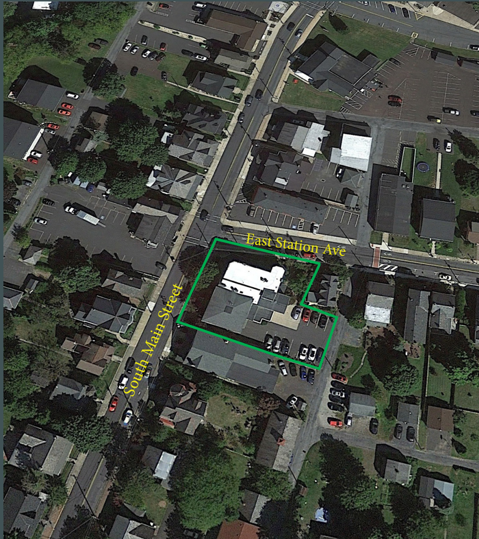
Site Outlined Parcel