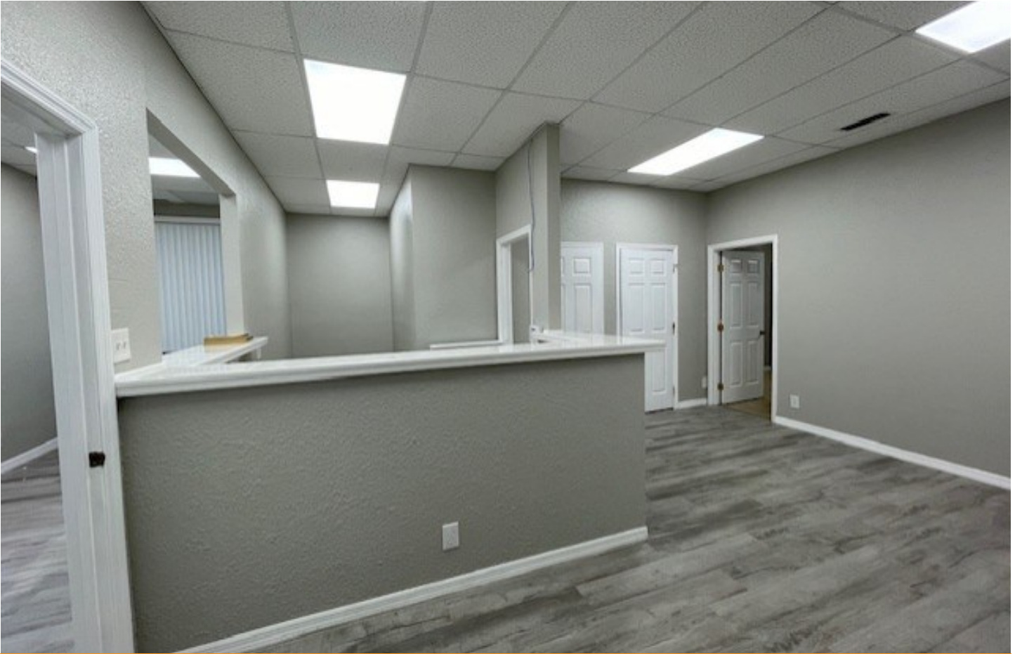
Suite 105 - Former Medical Clinic

503 N Orlando Ave, Cocoa Beach, FL 32931