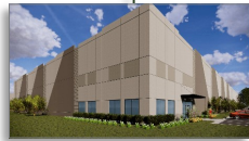
GARLINGTON NORTH (SITE)