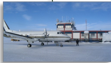
DOWNTOWN AIRPORT (7 MILES)