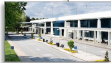
GSP INTL AIRPORT (5.9 MILES)