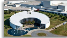
BMW (5.5 MILES)