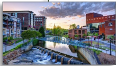
DOWNTOWN GREENVILLE (9 MILES)