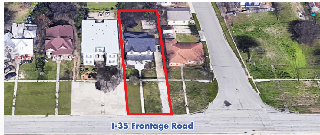
I-35 Frontage Road

The information herein was obtained from sources deemed reliable; however, DH Realty Partners, Inc. makes no guarantees, warranties, or representations as to the completeness of accuracy thereof. The presentation of this property is submitted subject to errors, omissions, changes of price, prior to sale or lease, or withdrawal without notice. All Floor plans, property lines, areas, and dimensions are approximate and for illustration purposes only. DHRP | DH Realty Partners, Inc. ©2024. A Texas Corporation.