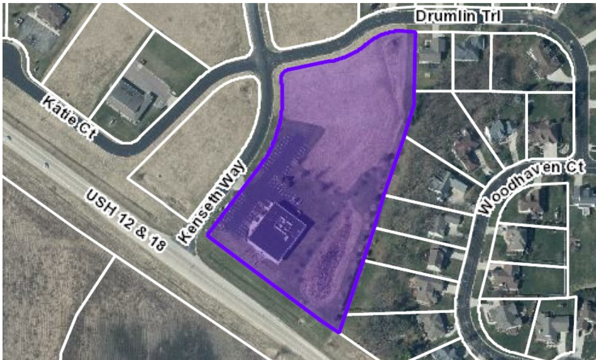
Aerial map showing building and land, shaded in purple