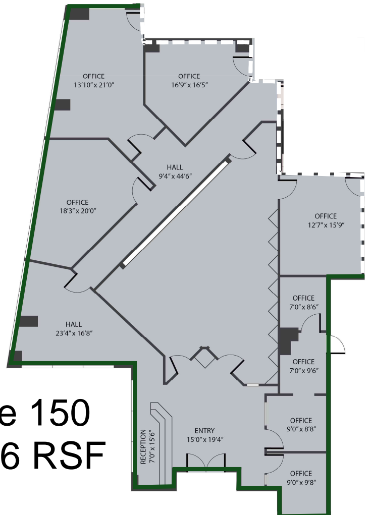
Suite 150 3,366 RSF