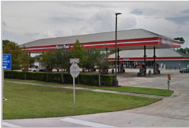
RaceTrac - Renovated 2017