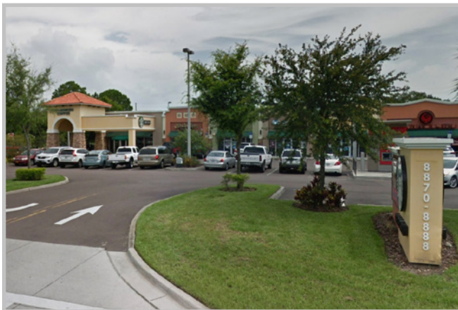
Starbucks - Built 2010