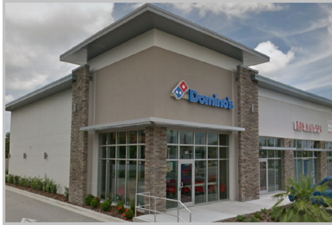
Domino's - Built 2018