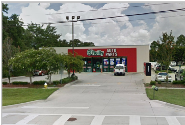
O'Reilly Auto Parts - Built 2013