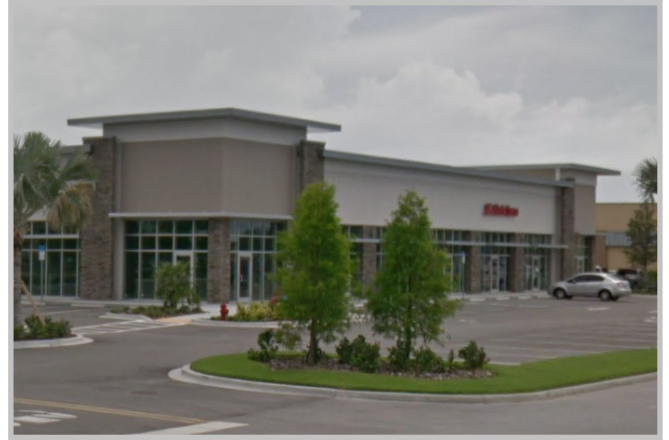
State Farm - Built 2018