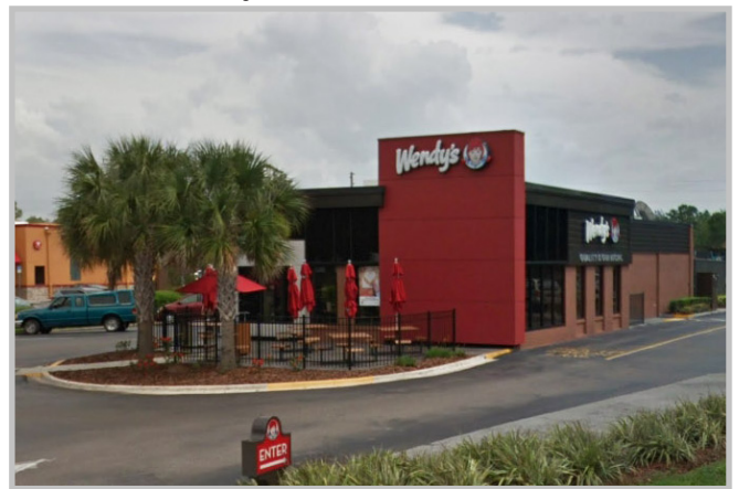
Wendy's - Renovated in 2017