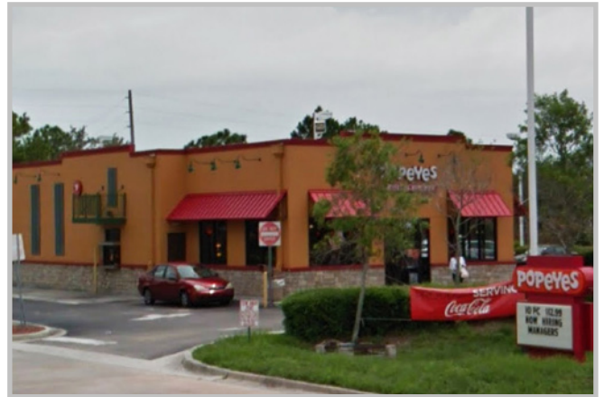
Popeyes - Renovated in 2017