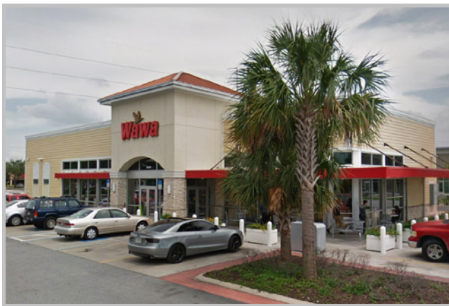
WaWa - Built 2014