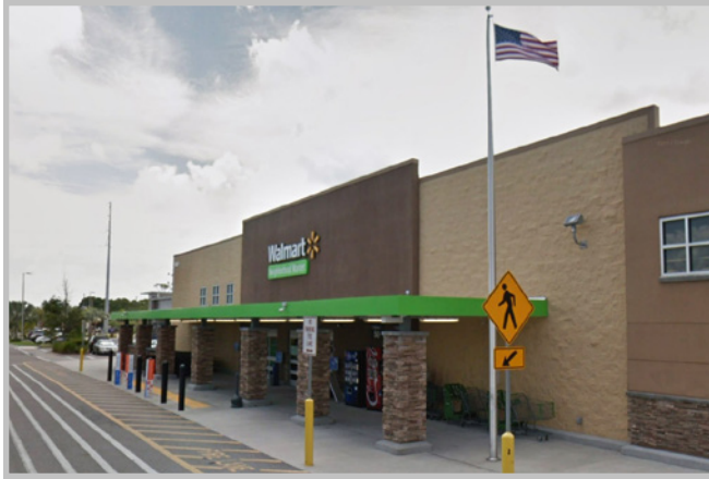
Walmart - Built 2014