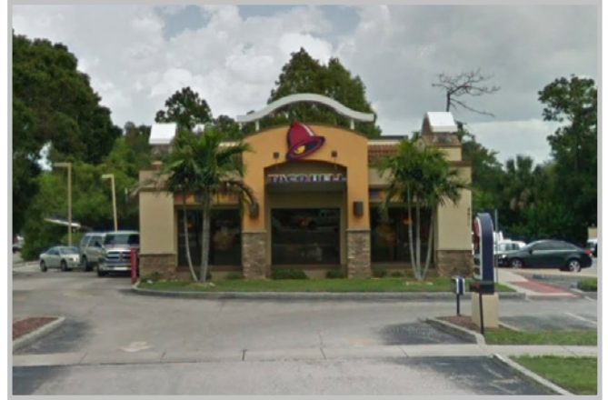
Taco Bell - Renovated 2017