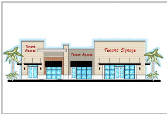
Willie Jewell's BBQ - Coming Soon 2019