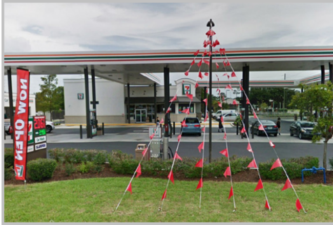
7-Eleven - Renovated in 2017