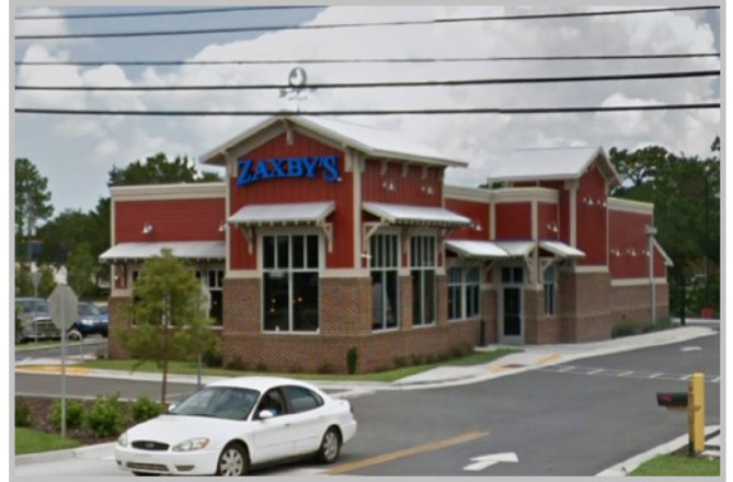
Zaxby's - Built 2017