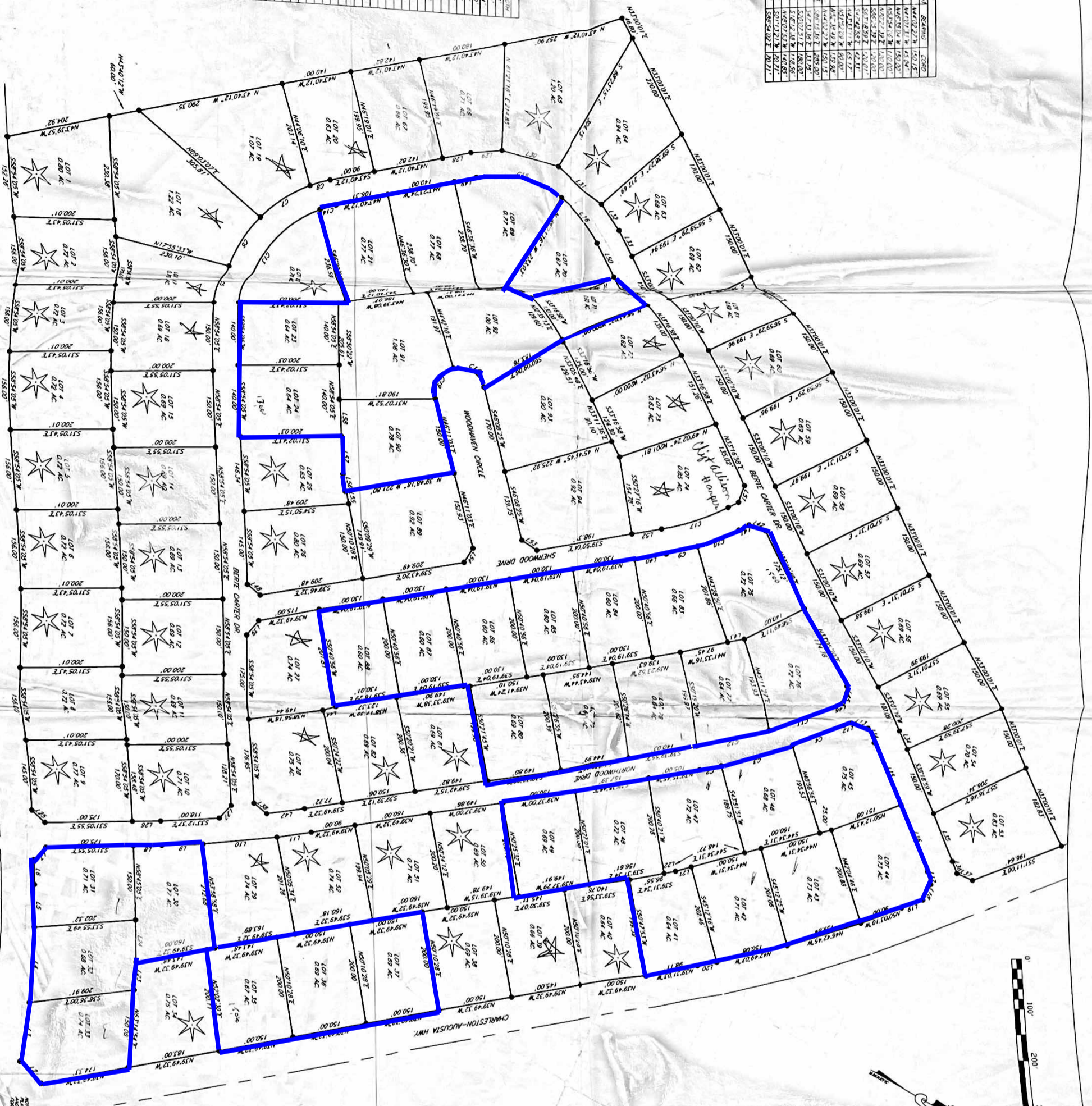
MAP OF NORTHWOOD SUBDIVISION