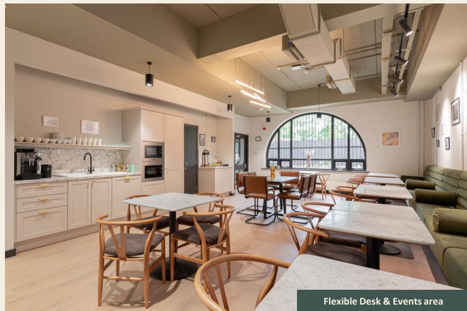
Flexible Desk & Events area