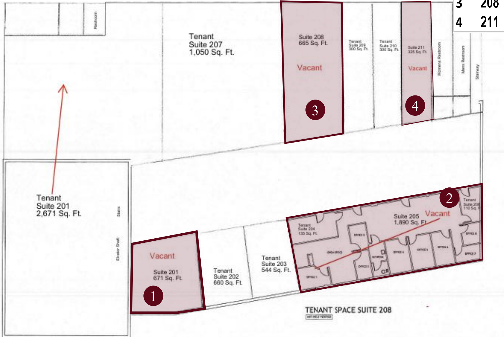
EXISTING SECOND FLOOR PLAN SCALE: 1/8"=1'-0"