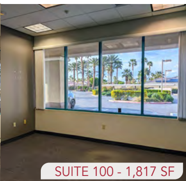
SUITE 100 - 1,817 SF