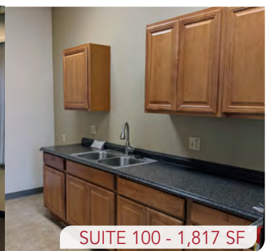
SUITE 100 - 1,817 SF

All information furnished regarding property for sale, rental or financing is from sources deemed reliable, but no warranty or representation is made to the accuracy thereof and same is submitted to errors, omissions, change of price, rental or other conditions prior to sale, lease or financing or withdrawal without notice. No liability of any kind is to be imposed on the broker herein.