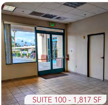
SUITE 100 - 1,817 SF