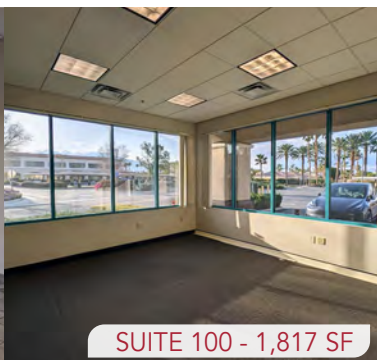
SUITE 100 - 1,817 SF