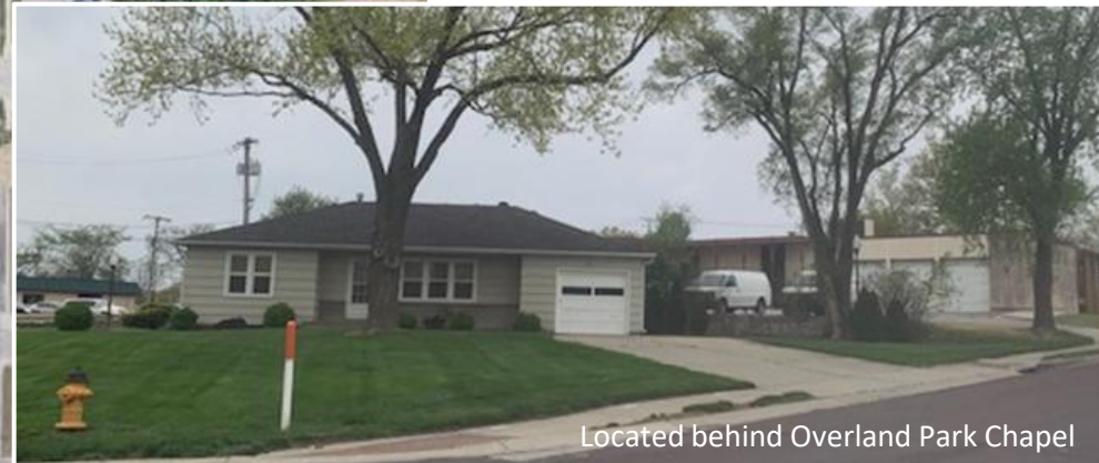
Located behind Overland Park Chapel