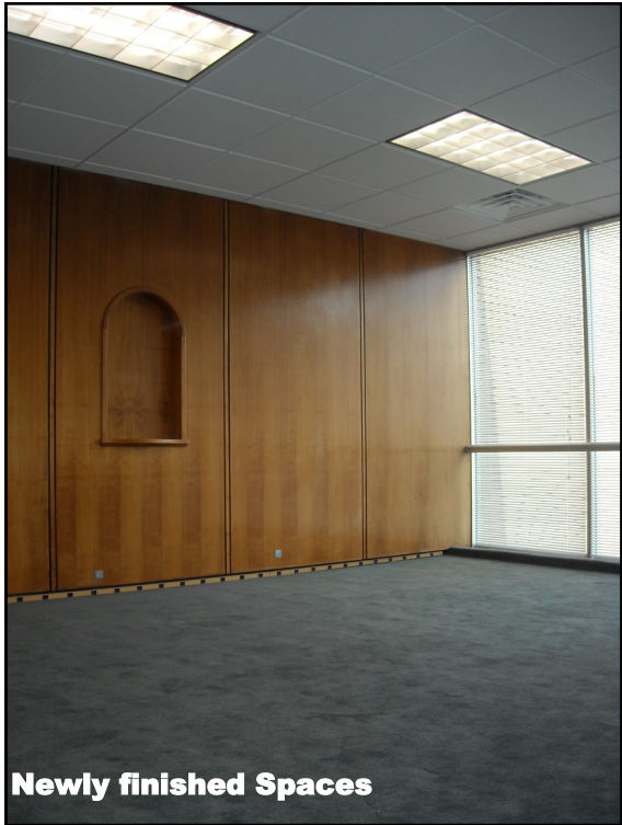
Newly finished Spaces