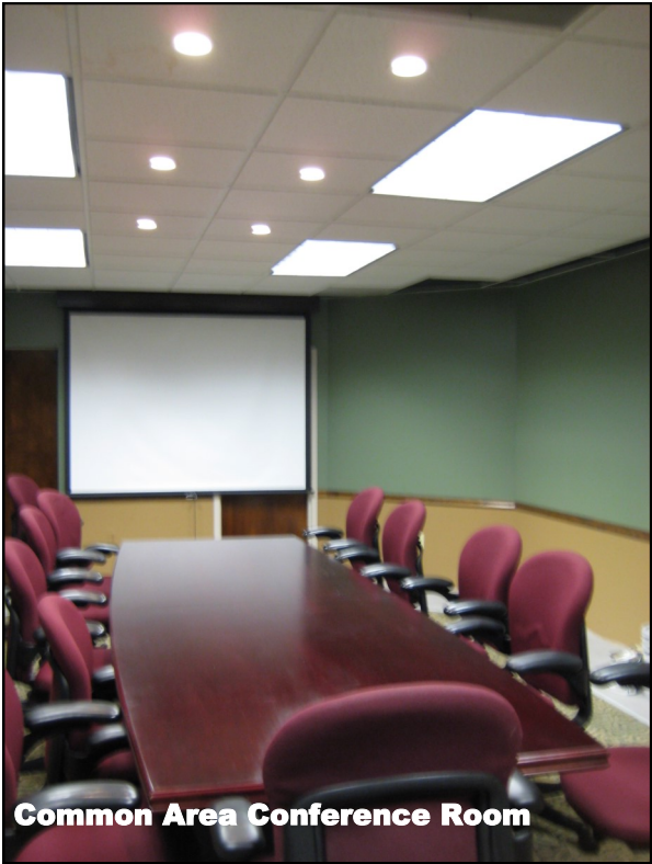
Common Area Conference Room