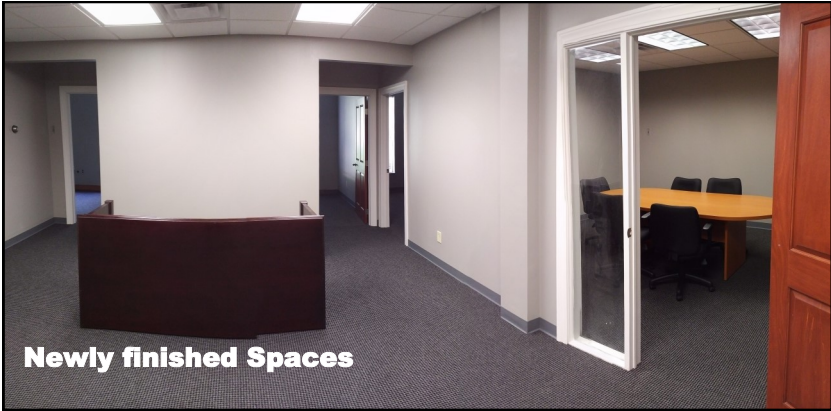
Newly finished Spaces