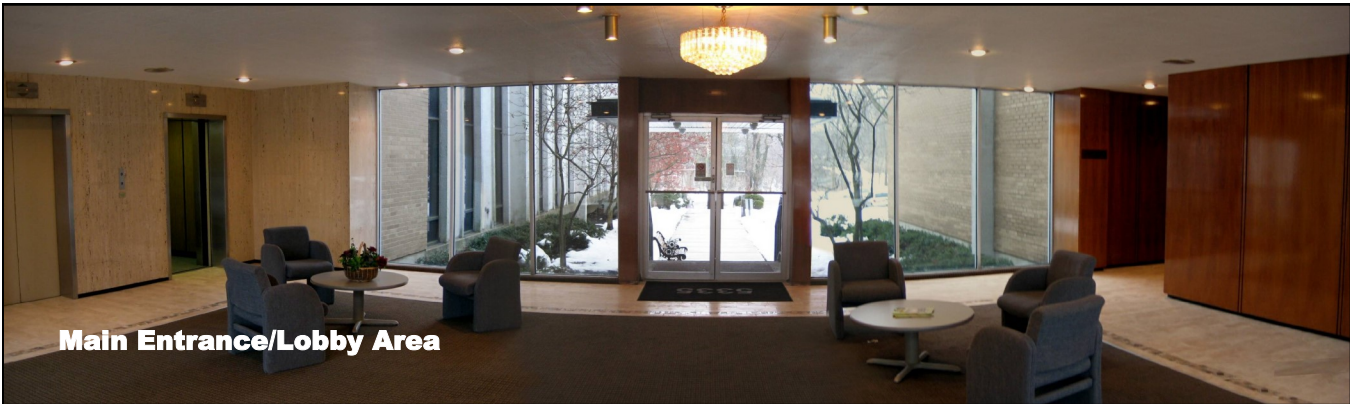
Main Entrance/Lobby Area