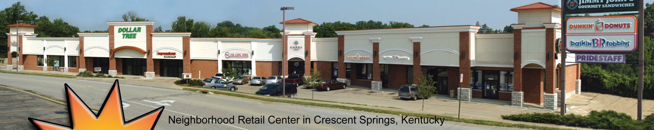
Neighborhood Retail Center in Crescent Springs, Kentucky