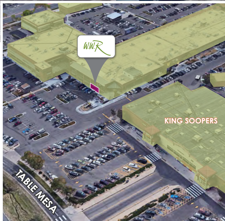
TABLE MESA SHOPPING CENTER