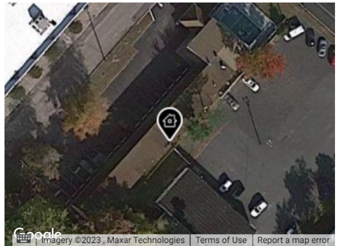
Legend: Subject Property