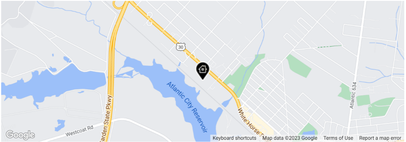
Legend: Subject Property