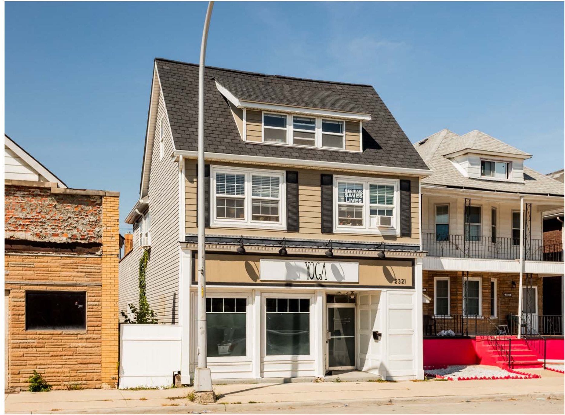
HISTORIC HAMTRAMCK STYLE, FIRST FLOOR STOREFRONT, PARKING OPTIONS AVAILABLE