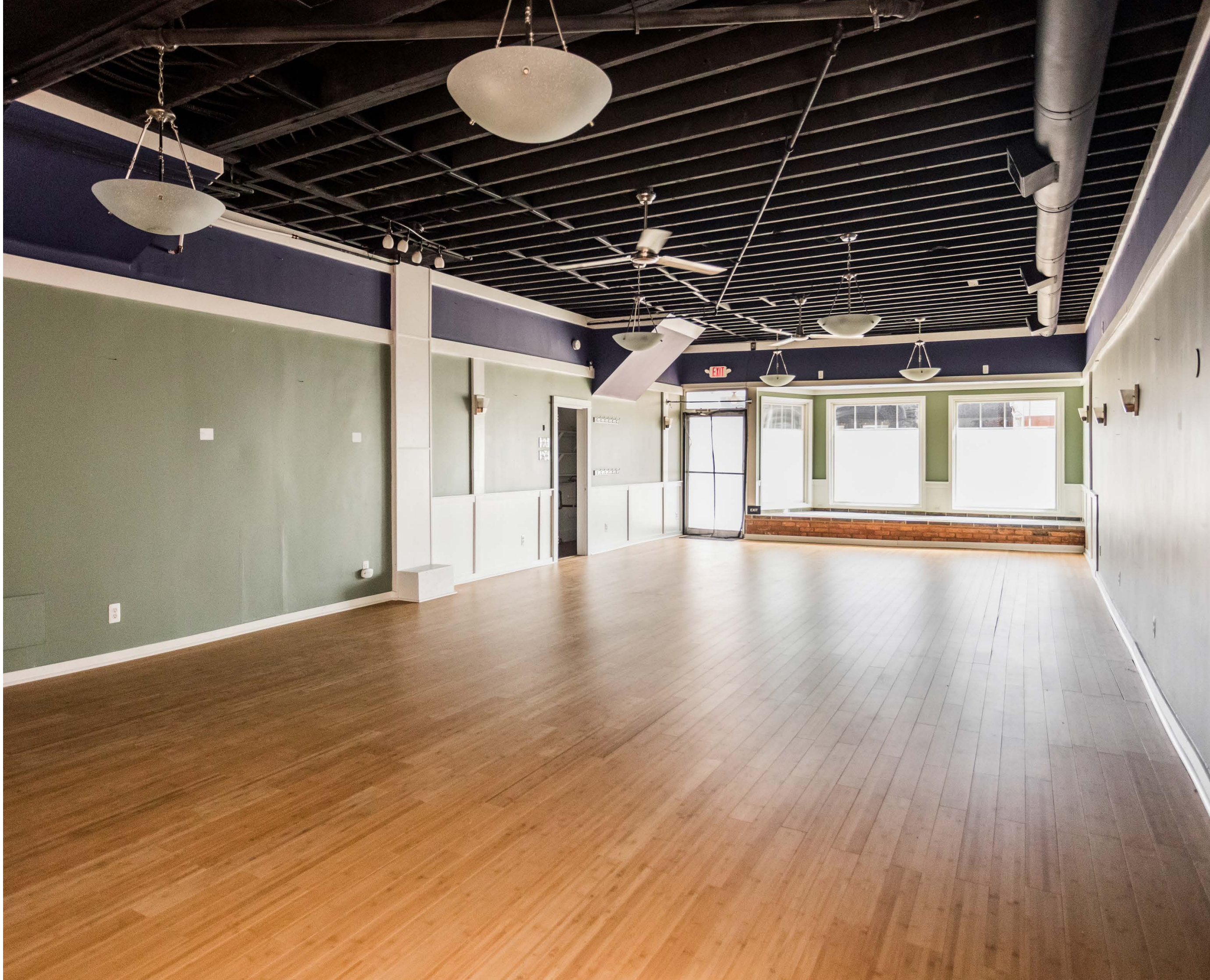
GROUND FLOOR RETAIL SPACE, OPEN FLOOR PLANS, STORAGE ROOMS AND BASEMENT SPACE