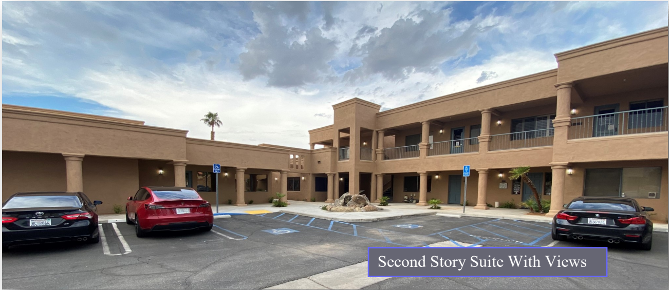
Second Story Suite With Views