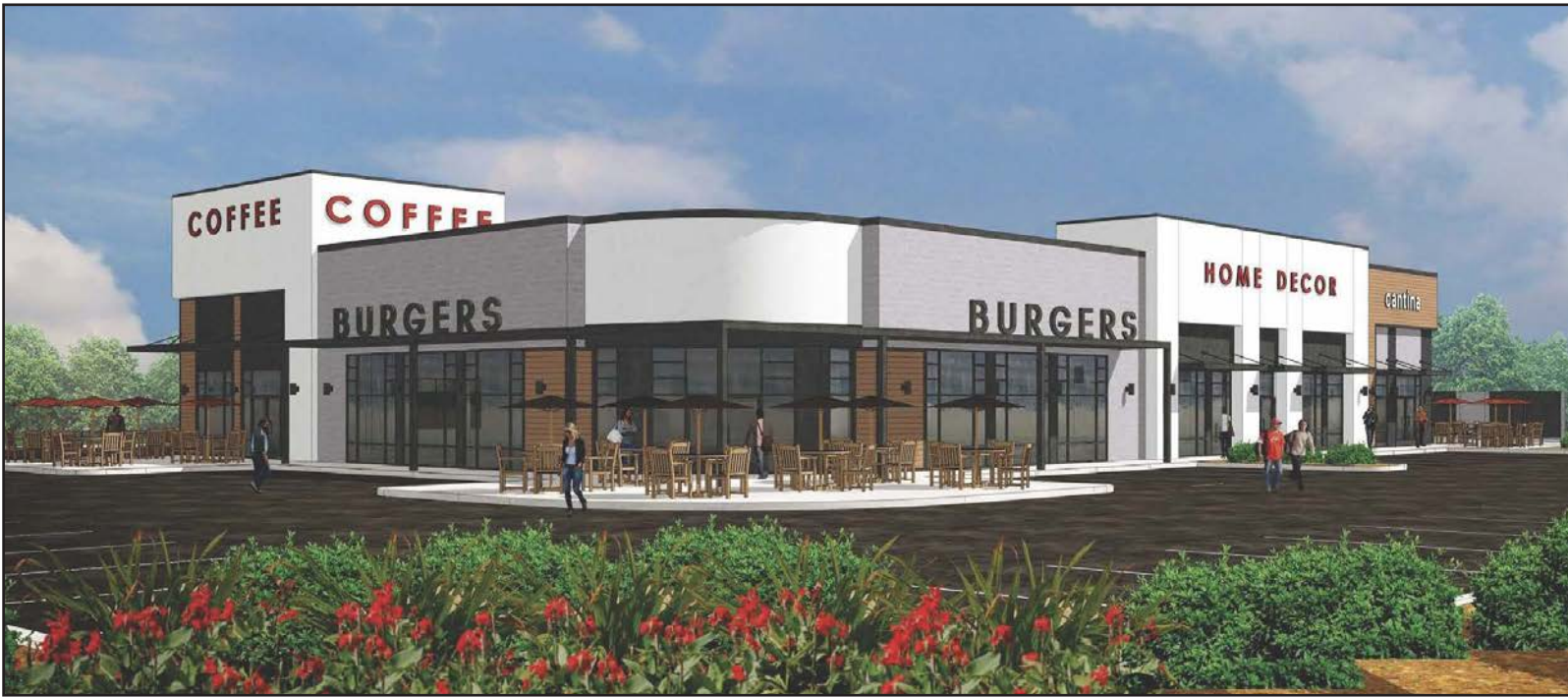
New Retail Shops | 6150 College Drive, Suffolk, Virginia