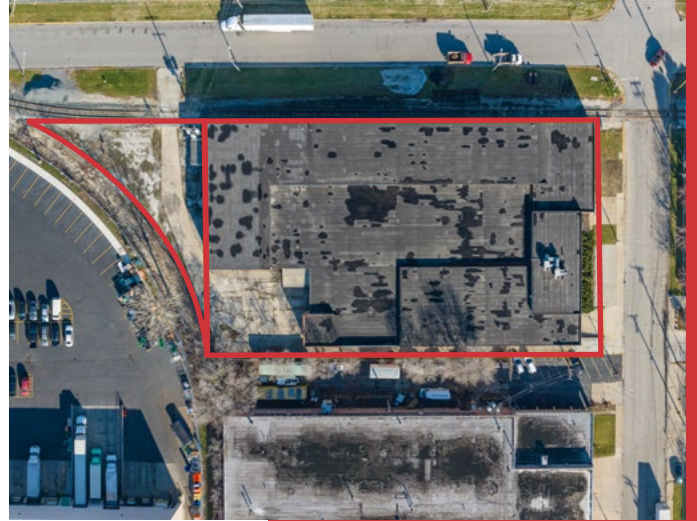
Pictured: Parcel outline of property