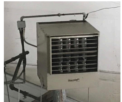
Gas Space Heaters