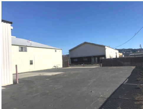
Secure Paved Yard