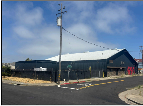
New Reflective Roof