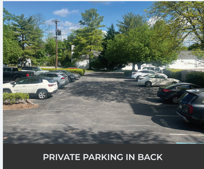
PRIVATE PARKING IN BACK