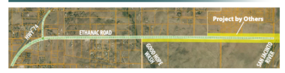
The alignment for this segment will be a direct westerly extension of the existing Ethanac Road starting from the west edge of the new San Jacinto River bridge (to be built by others), connecting to Highway 74. Three options for connecting Ethanac Road and Highway 74 are proposed to be studied in the next phase.