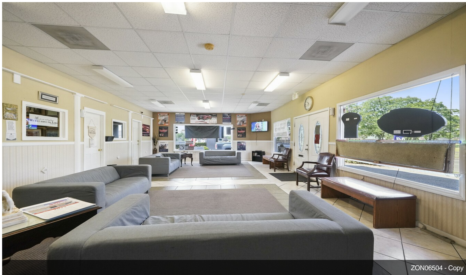
ZON06504 - Copy