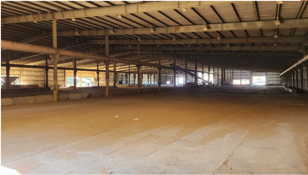
Back to Front View