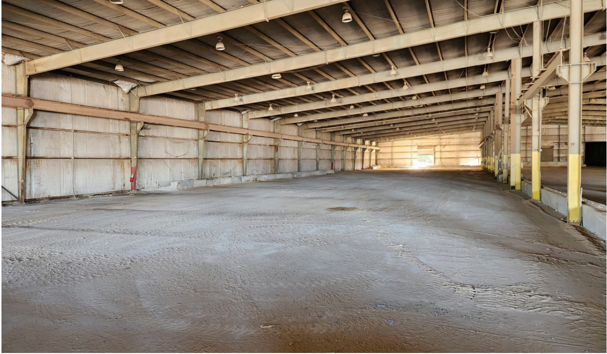
Front to back view