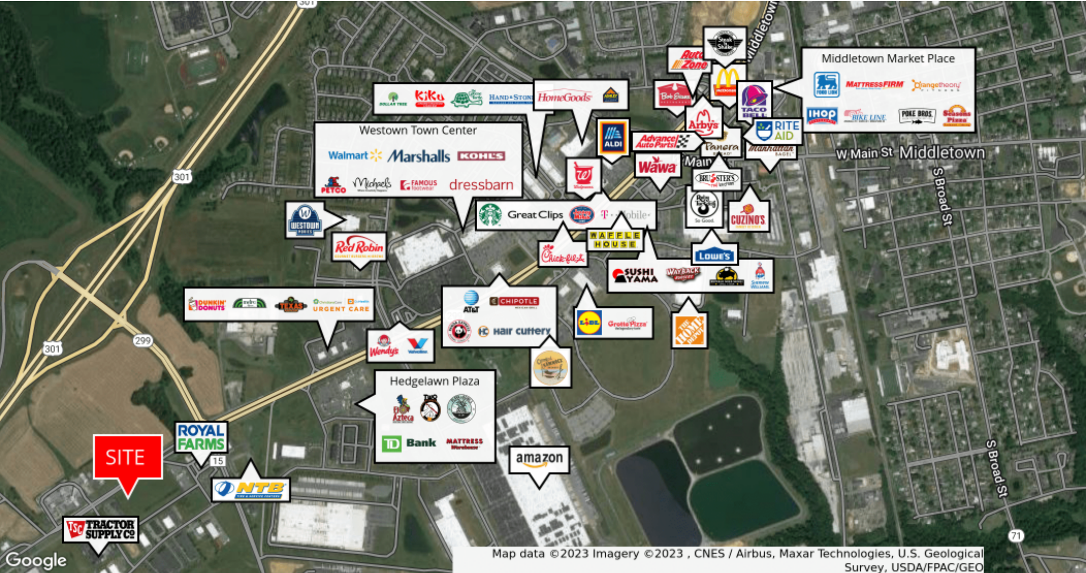
Map data © 2023 Imagery © 2023, CNES / Airbus, Maxar Technologies, U.S. Geological Survey, USDA/FPAC/GEO