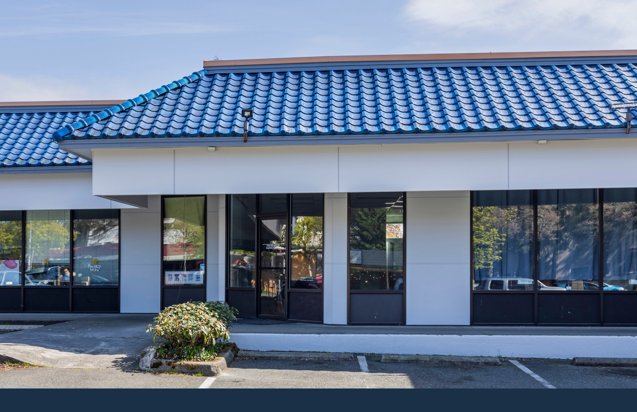
1,125 SF Retail or Office Space for Lease at Atrium Square 11730 15TH Ave NE Seattle, WA 98125 $27.00/SF/Year NNN