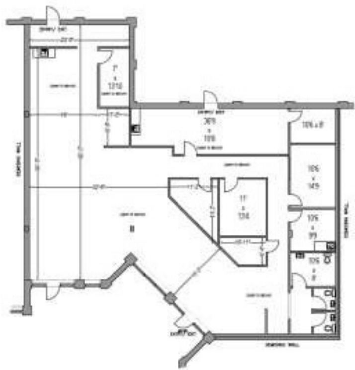
UNIT 10 - 4,086 SF