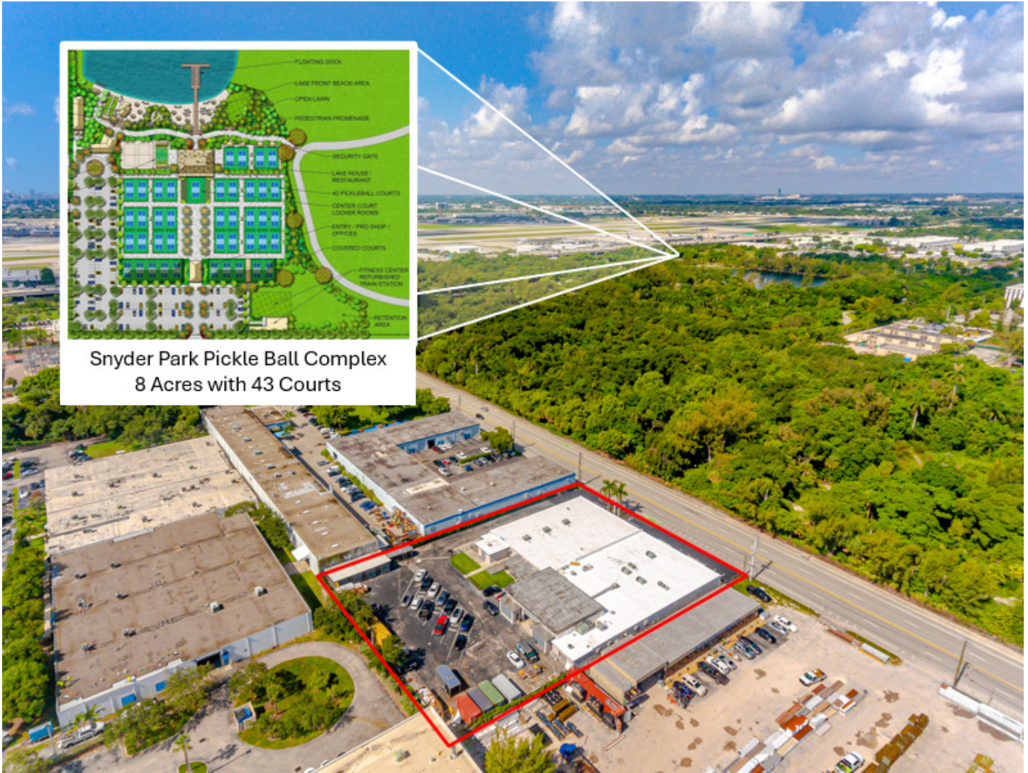
Snyder Park Pickle Ball Complex 8 Acres with 43 Courts